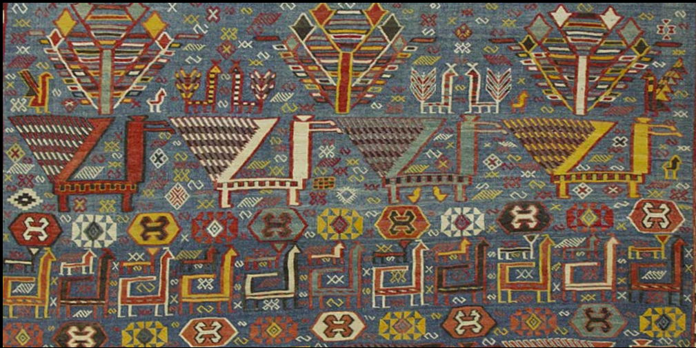
Photo archives, research portfolios and original hand painted designs trace the development of weaving in Azerbaijan and Georgia under the direction of the Russian Empire

Collection of Azerigalida Joint Stock Company, Baku