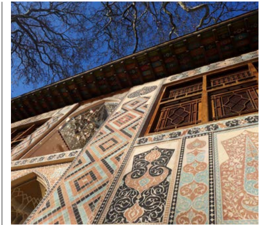
Sheki Khans' Palace