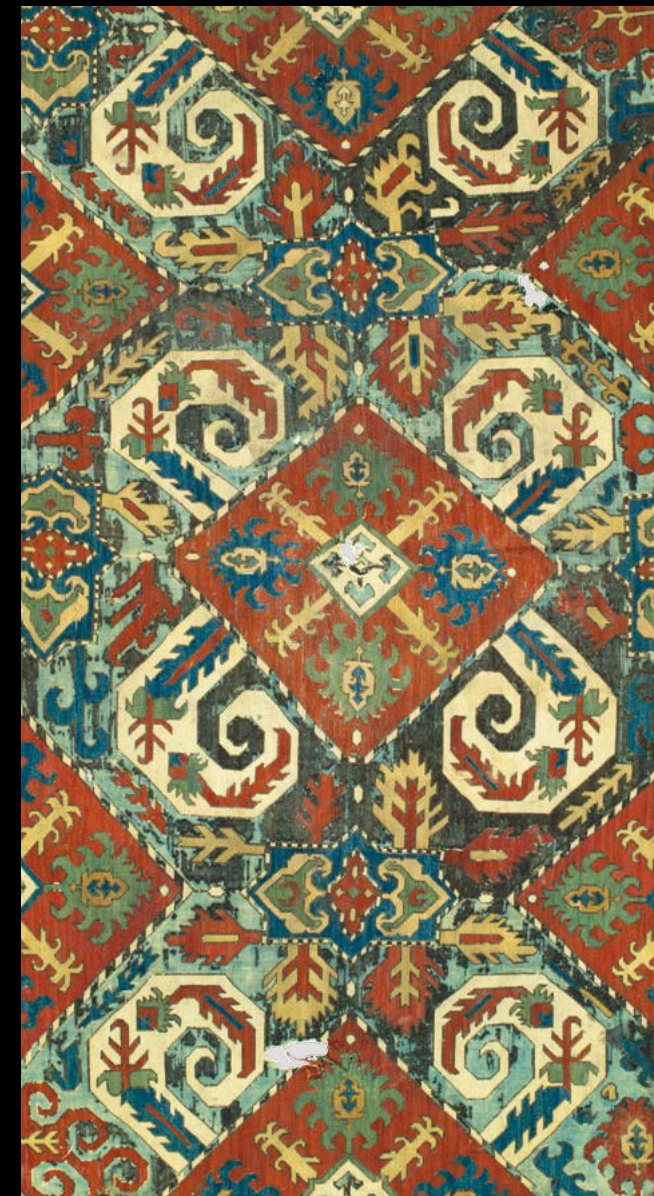
Silk cross stitch embroidery, 18th century, Azerbaijan National Art Museum, Baku