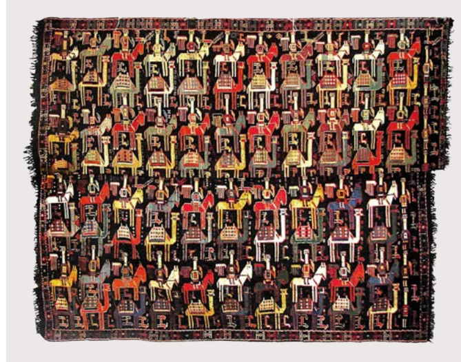
Shadda, Karabagh, 18th century, Simon Janashia National Museum of Georgia Collection, Tbilisi

In 2017 the HALI Tour to the Caucasus starts the day after the 5th International Symposium on Azerbaijani Carpets ends in Baku. The timing provides the perfect opportunity to share the knowledge and experience we have gained from HALI's two previous tours to the region.