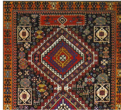
Shirvan, 19th century, Azerbaijan, Janashia NMG Collection, Tbilisi