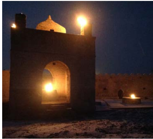
Ateshgah fire temple, Baku

HALI Tours represent the distillation of more than thirty-five years of HALI articles and the experience gathered through their preparation.