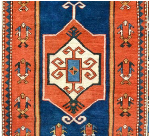
Fachralo prayer rug made in 2016/17 by ReWoven