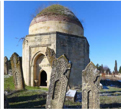
Yeddi Gumbaz Mausoleum